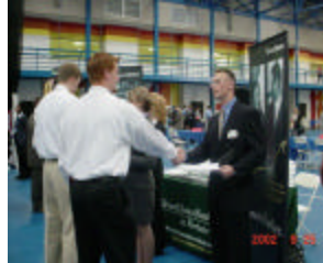
Students, alumni, and other guests extend a hand, and a possible resume, to employers

Career Services invites students who would benefit from additional assistance in job searching to contact the office. Career Services maintains relationships both with the companies in attendance at the Career Fair, as well as those that could not attend. For more information